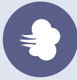
Winds and downbursts