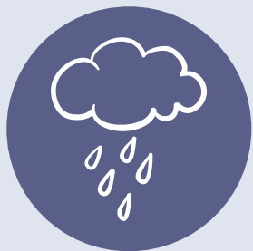
Heavy rain and flooding