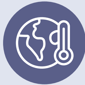
Extreme hot or cold temperatures